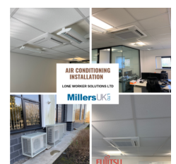
Multi Split Systems (Air Conditioner) 2 & 3-4 Rooms Multi