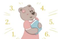
Mar 16, 2020 Sofi's 6 Golden Rules to stay safe against COVID-19