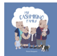
Apr 28, 2020 Meet The Cashmirino Family