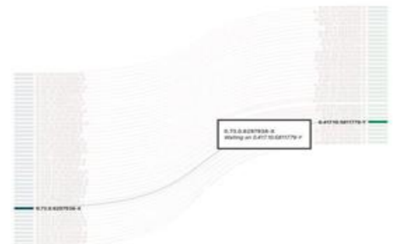
Shows Transaction dependency for a single transaction.