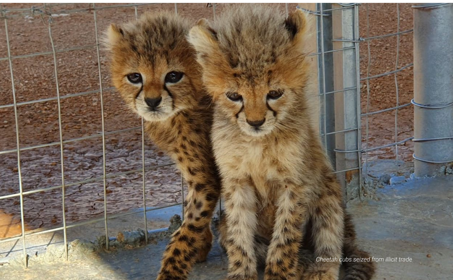
Cheetah cubs seized from illicit trade