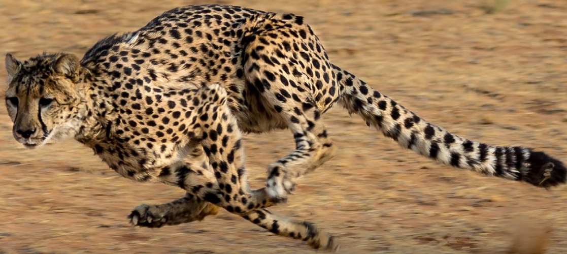
A Cheetah Acinonyx jubatus in Namibia