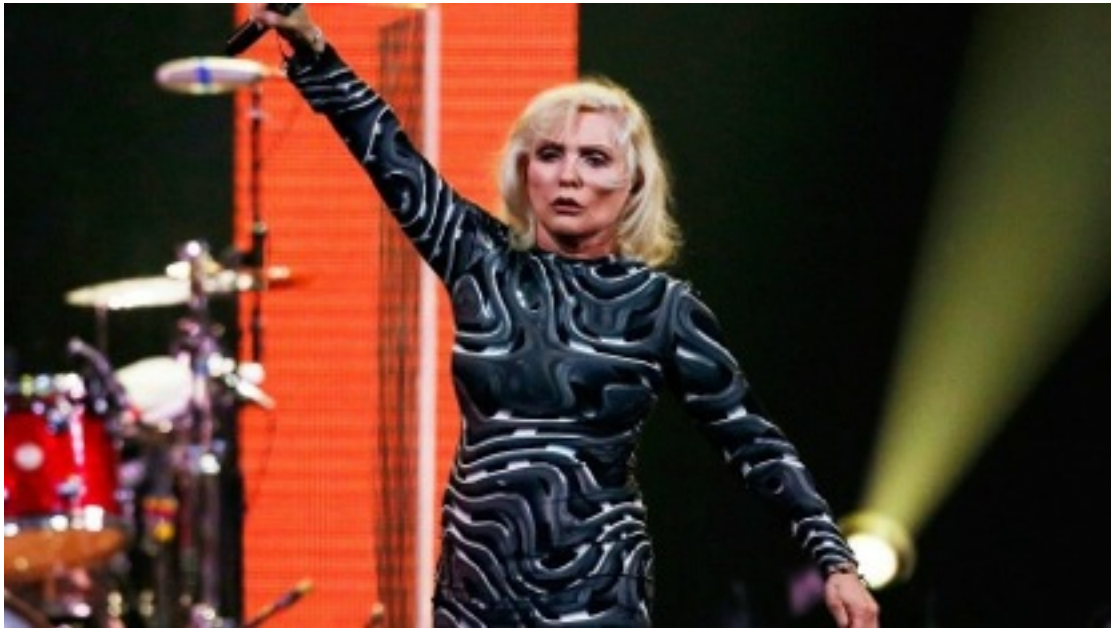
Amnesty International Concert NYC