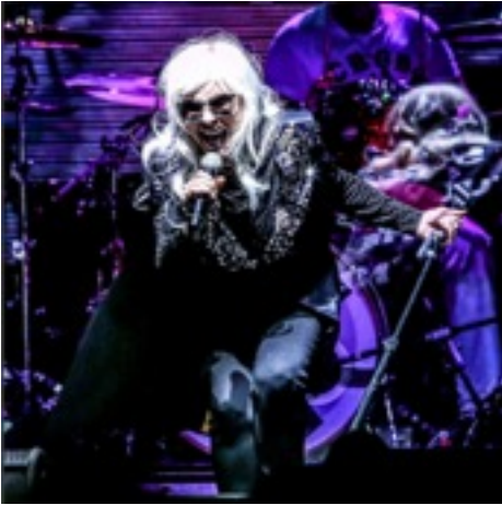
Studded cape - Pollinator tour