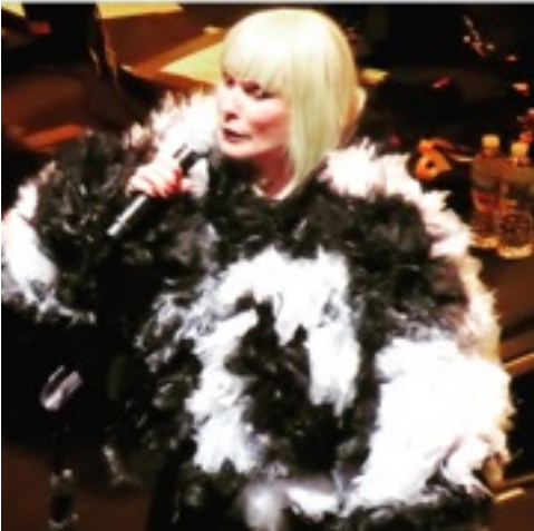
Blondie Rage and Rapture tour NYC