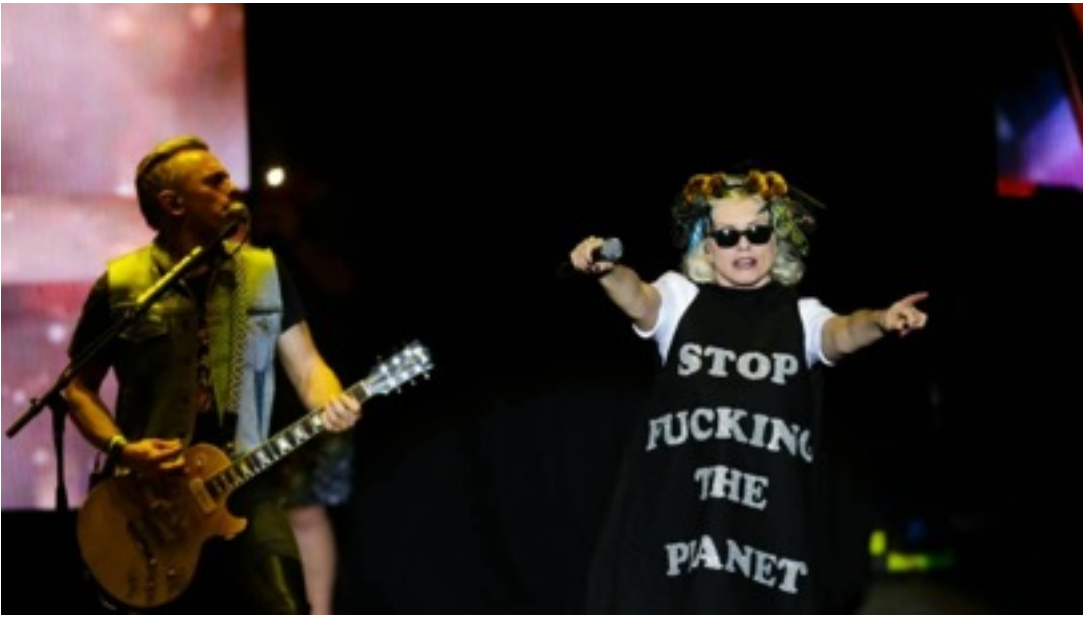
STOP FUCKING THE PLANET Capes - on the Blondie / Rage and Rapture / Pollinator tour