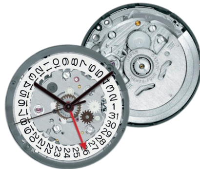
Seiko NH34A Automatic Calibre