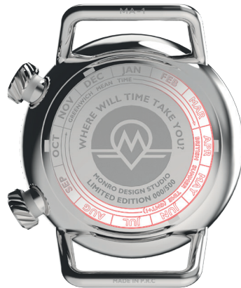
British Summer Time reference