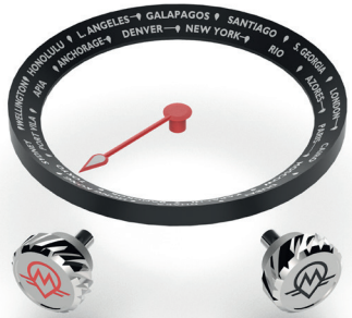
Colour-coded crown function