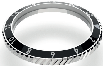
Ceramic uni-directional diver's bezel