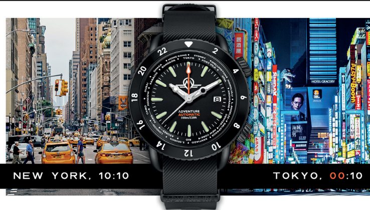
NEW YORK, 10:10